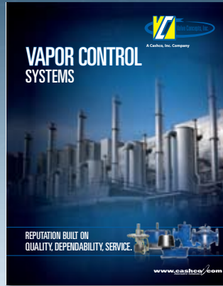
Vapor Control Systems